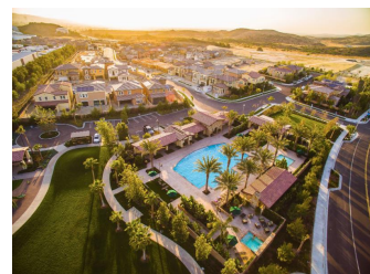
Fair Housing Landlord Workshop