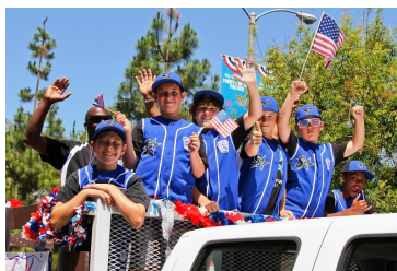
Fourth of July logo Design Contest