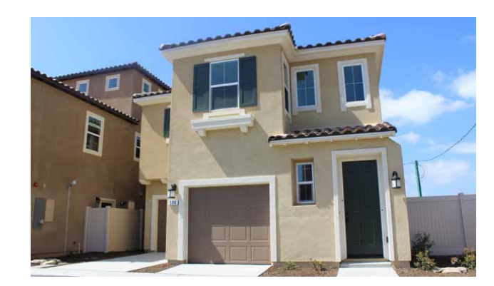
Encanto Model Home

The City Council approved the schematic design in September 2016, which visualizes the building floor plans, elevations, and three-dimensional renderings. Grading will take place in the coming months, with construction of the campus buildings anticipated to commence starting fall 2017. The completed Civic Center is slated for spring 2019. For more information on the Civic Center and to track its progress, visit lakeforestca.gov/civiccenter.