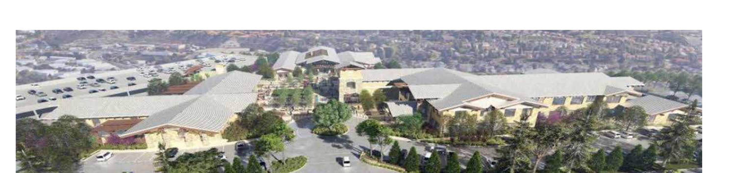
Rendering of the future Lake Forest Civic Center